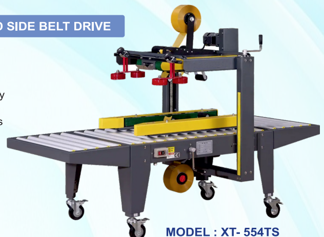
MODEL : XT- 554TS